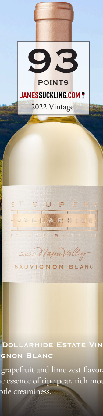
2022 DOLLARHIDE ESTATE VINEYARD SAUVIGNON BLANC

Yellow grapefruit and lime zest flavors follow with the essence of ripe pear, rich mouth feel, and subtle creaminess.