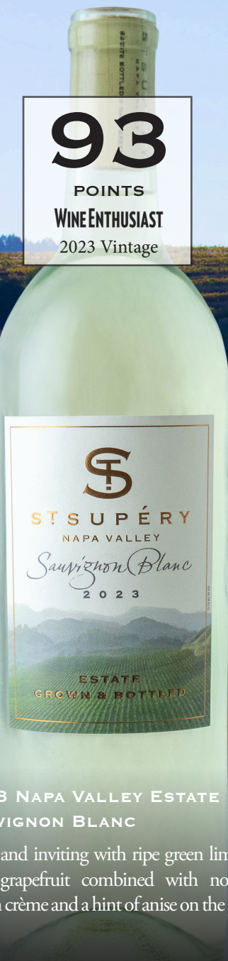
2023 NAPA VALLEY ESTATE SAUVIGNON BLANC

Crisp and inviting with ripe green lime and pink grapefruit combined with notes of lemon crème and a hint of anise on the palate.