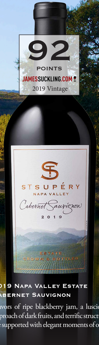
2019 NAPA VALLEY ESTATE CABERNET SAUVIGNON

Flavors of ripe blackberry jam, a luscious approach of dark fruits, and terrific structure are supported with elegant moments of oak.